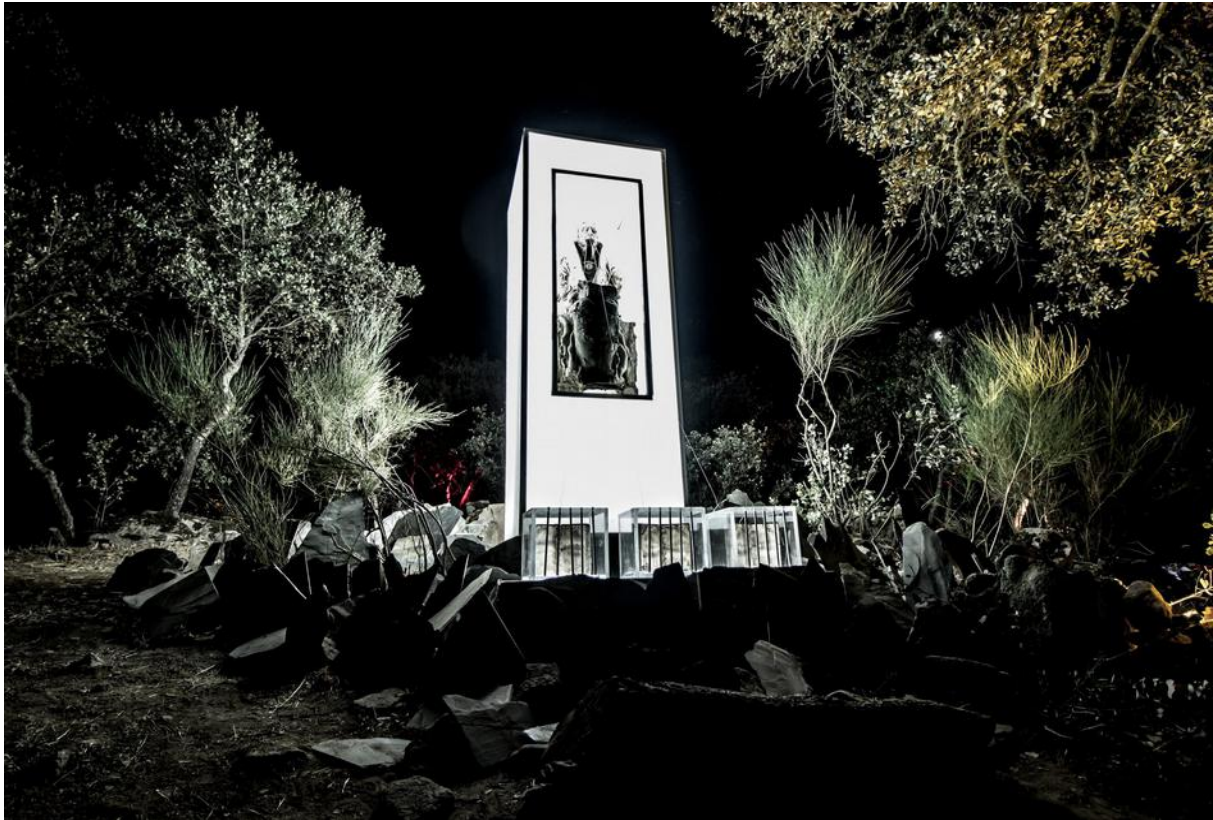
Installation « Boom festival » 2018