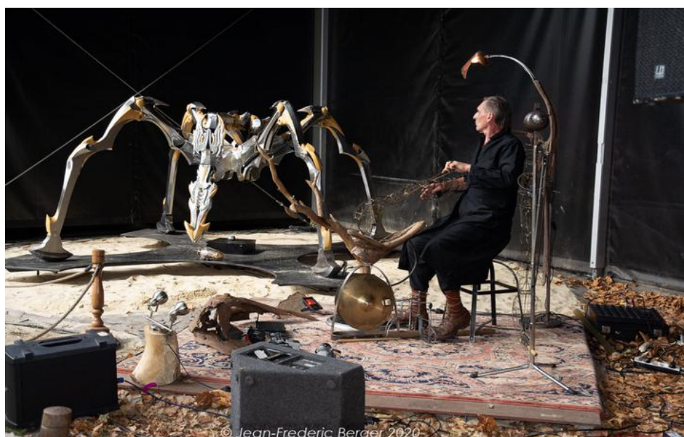
Sound performance « Le Cercle cubik » 2021