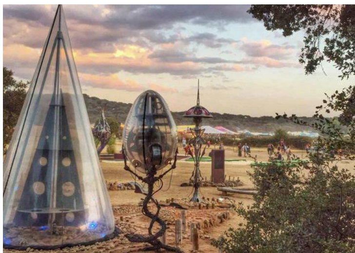
Installation « Boom festival » 2017