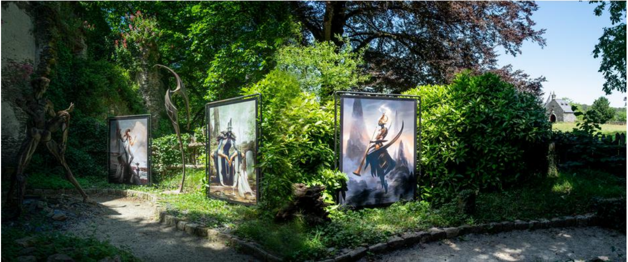
Gardens of the Naia Museum, Rochefort en Terre