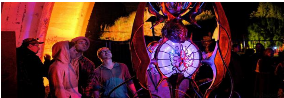
Installation festival d'art « FON 2017 »

The team has been exploring the scenographic universes of festivals and exhibitions for more than 20 years, which gives it a certain technical and aesthetic experience that can accompany all your desires and needs.