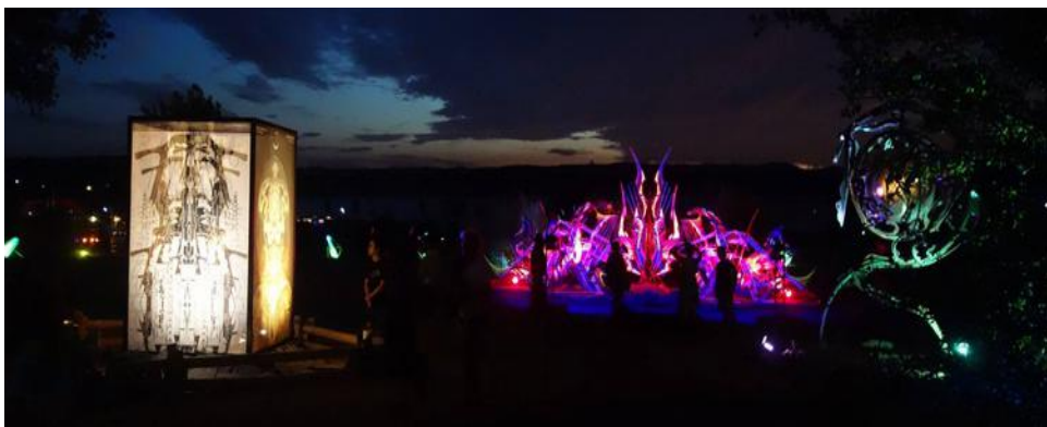
Installation « Boom festival 2018 »

If the major identity of the museum is based on highlighting the Arts of the Imaginary, in the heart of the castle of Rochefort en Terre, then it is up to us to spread their magic outside the walls of the Naia. We offer turnkey exhibitions, as well as partnerships with various cultural institutions and event structures.